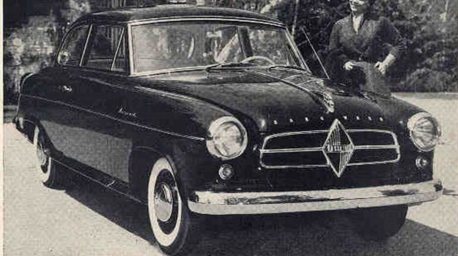
ISABELLA "1500" 6 passenger Sport Coupe

The all new beautiful Borgward "Isabella" 6 passenger Sport Coupe is Europe's finest engineered masterpiece in the economical Small Car Field. The Isabella has: